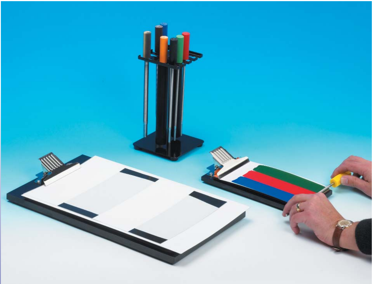
Small K Hand Coater with cleaning/storage rack. Three liquid inks being applied simultaneously. Also shown, Large K Hand Coater with a contrast test card.

The K Hand Coater provides a simple but effective means of applying paints, printing inks, lacquers, adhesives and other surface coatings onto many substrates including paper, board, plastic films, foils, metal plates, glass plates, wood etc. Two or more coatings can be applied side-by-side in a single operation making the system ideal for comparing products.